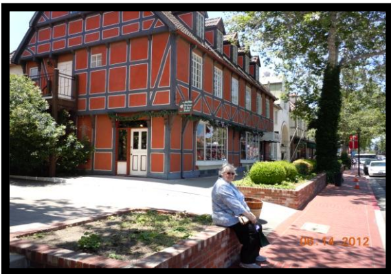
Louise Randolph enjoying the sun on our trip.

Another curiosity was the imperfect signage in the motel. The general information says that the ice machine is on the first floor in Building B. You go onto that floor and there is no indication at all to guide you to the ice. It turns out that it is at the end of the hall behind a door simply labeled Room 141 . Closer browsing reveals a handwritten message posted on the outside of the door at the far end of the building. But it does have at least one positive element unrelated to ice: a bathtub with an ADA-aware bathtub bottom so that you are not in constant peril of slipping and breaking a bone.