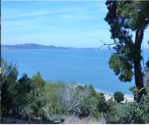
View of the Bay from the Romberg Tiburon Center