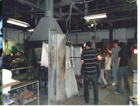
Watching artisans at work at the Lundberg Studio