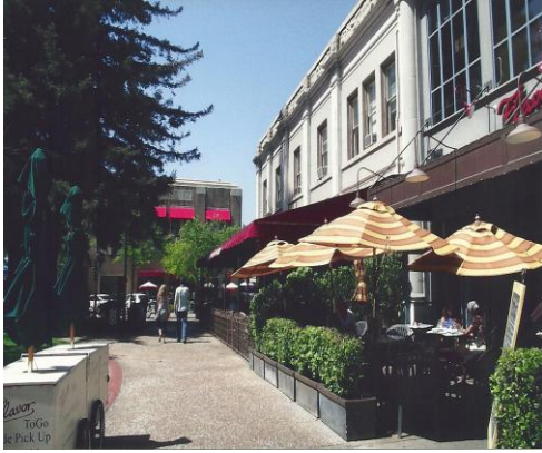
Lunch in Santa Rosa after the Tzars Exhibit

Watch for information in our 2013 Off-Campus Bulletin for information on our next event.