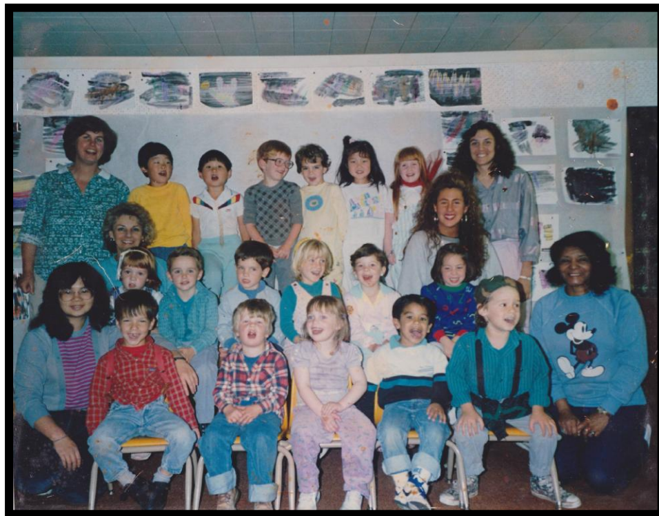
The Child Study Center at San Francisco State University, class of four-year olds in 1988.