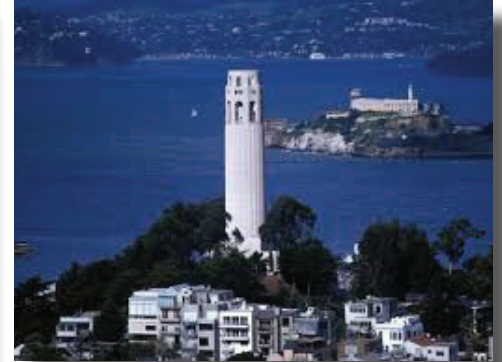
The history, the art and the view.