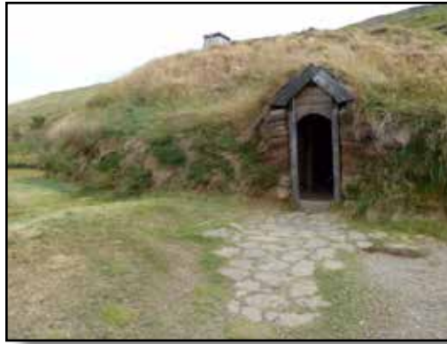
The reconstructed turf house in Iceland on the same land that belonged to Erik the Red. Leif Erikson was born here.